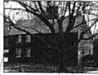
12. Jabez Howland House